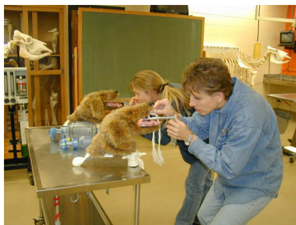
Veterinary students learn intubation using the Rescue Critters® K-9 Intubation Trainer.