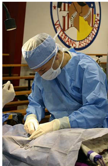
A veterinary student performs surgery during a HSVMA Field Services clinic.

Clinical practice—such as with spay and neuter clinics, community practice operations, shelter medicine rotations, feral cat clinics or other clinical settings—give students the opportunity, under supervision, to interact with live patients, increase their learning opportunities and provide beneficial treatment for the animals. Many veterinary schools are partnering with local animal shelters and rescue groups to provide spay and neuter services for dogs and cats who are then returned for adoption. The use of models, mannikins and simulators, multi-media computer simulation, and ethically-sourced cadavers provide options for anatomy training, clinical and surgical skills practice, improved conceptual understanding and problem-solving capabilities, and hands-on training that treat and/or benefit live animals.