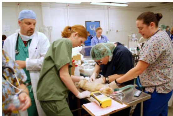
Second, third and fourth-year students prepare a feral cat for surgery and monitor anesthesia under the supervision of an anesthesia resident.

The veterinary college at Iowa State University hosts a similar clinic run by the Feral Cat Alliance, a volunteer group made up of students and faculty from the school. 7