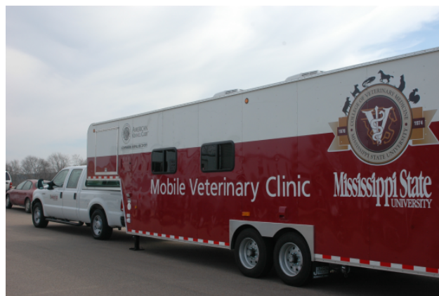
The Mississippi State University's Mobile Veterinary Clinic.

a mobile veterinary unit owned by the school. During that rotation they make two trips to shelters and during those trips perform, on average, between 15 to 20 sterilization surgeries. Both the surgery labs and the CVS shelter trips are now part of the required curriculum. In the fourth year, Mississippi State offers a Shelter