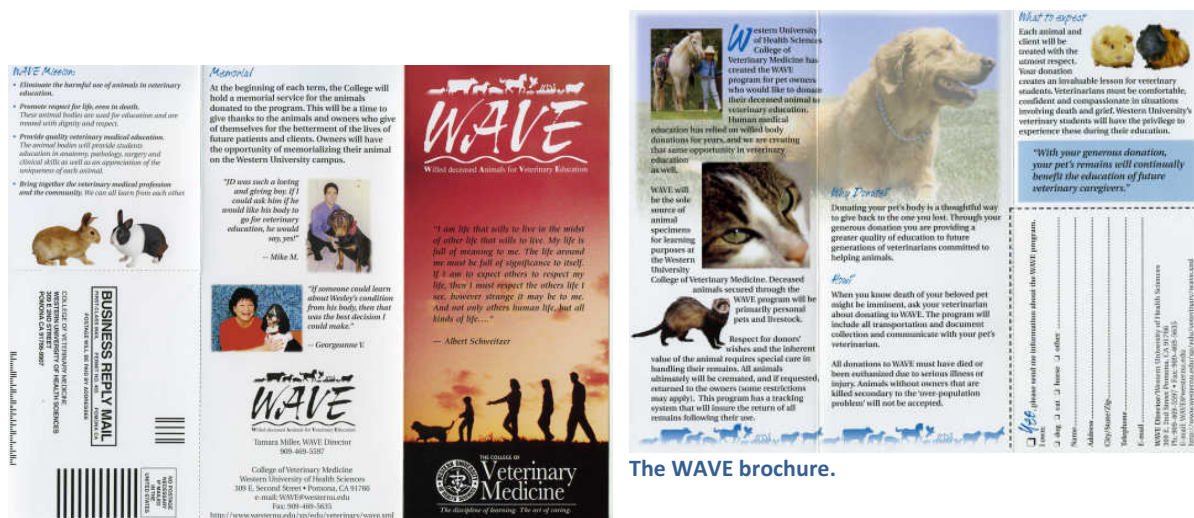
The WAVE brochure.

An integral component of body donation programs is the tactful and respectful treatment of the clients who are donating their former companions for use in veterinary training. When properly implemented, as many as half the clients choose to donate their pet's body for training (many welcome being able to do so). Some veterinary schools memorialize the former animal companions. For example, at Western University, a memorial service is held at the beginning of each term to acknowledge the humans who are donating their companion animals and to celebrate the animals' lives. 14