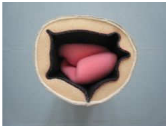
The DASIE—Dog Abdominal Surrogate for Instructional Exercises