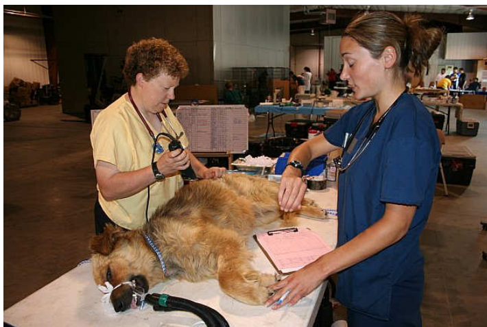
HSVMA Field Services in action—surgery prep and surgery.

This unique program provides hands-on training for hundreds of veterinary students each year at clinics on Native American reservations and other under-served regions of the United States, as well as some international locations. Students perform a variety of functions at the clinics, ranging from physical exams to medical procedures to spay and neuter surgeries, depending on their level of training. During 2008, HSVMA Field Services trained more than 400 veterinary students from 20 veterinary schools in the United States and Europe in surgery, anesthesia, analgesia and humane animal handling. During that time, the Field Services team treated 6,500 animals. 10