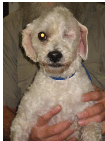
A HAARTS patient recovering from an eye-enucleation.